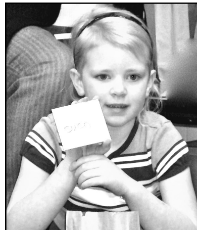
Title I brings parents and teachers together to work with children.

Title I is the largest federally-funded educational program. The federal government provides funding to each state. State educational agencies send this money to school districts. How much money each school receives is determined by the percentage of those who qualify for the Free & Reduced Lunch program.